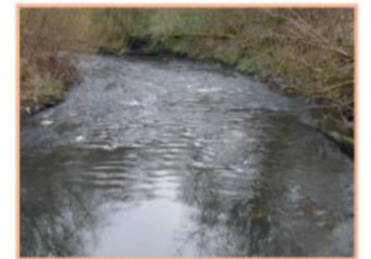
Photo of River by @grazer_milky on Flickr licensed under CC BY 2.0

Many rivers run through Manchester, such as the river Medlock, the river Mersey and the river Irk.